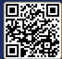
English Course List

“Handong Global University’s academic curriculum has interdisciplinary, holistic approach to Christian education”